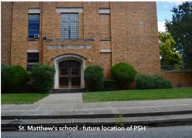
St. Matthew's school - future location of PSH