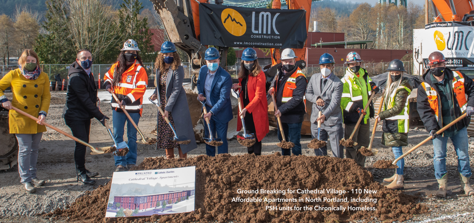
Ground Breaking for Cathedral Village - 110 New Affordable Apartments in North Portland, including PSH units for the Chronically Homeless.

To achieve these goals, the use of repurposed surplus church property (where feasible) to develop the PSH is encouraged. Also, an Integrated Health Model of Care is the hallmark of the initiative. Therefore, each PSH project will be developed to include space for onsite and accessible: