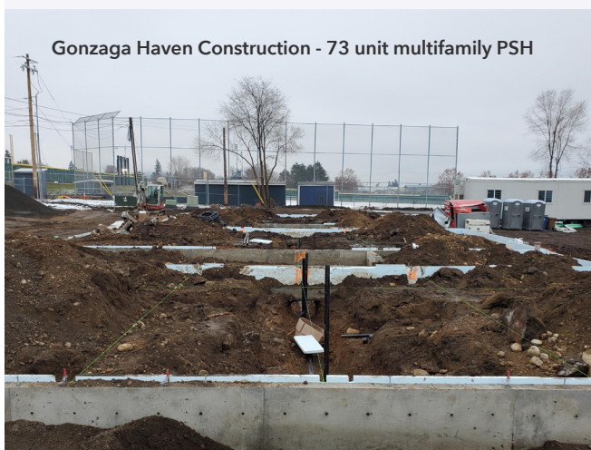
Gonzaga Haven Construction - 73 unit multifamily PSH