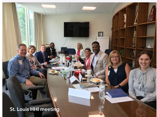
St. Louis HHI meeting