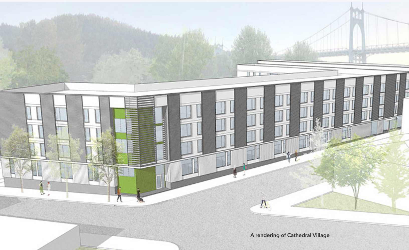
A rendering of Cathedral Village

The COVID-19 pandemic impacted the progress of CCO's HHI project. It slowed local permit review and application processes. It also impacted the capacity of internal and partner teams to focus on HHI projects due to competing priorities focused on the pandemic (refers both to changing workplace impacts for all partners and responsiveness related to healthcare implications for PSJHS). Nevertheless, the pandemic enhanced conversations with stakeholders around the need to build more affordable housing and PSH.