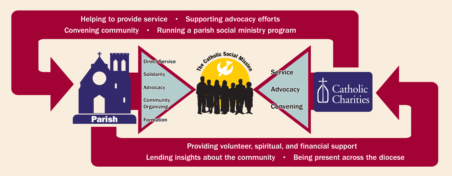
Diagram II: Creating Synergy in Our Shared Mission Through Partnership

As this diagram illustrates, by working in partnership, Catholic Charities agencies and parishes can create a synergy that makes it possible to care for more people in need, work for justice, and provide opportunities for the faithful to grow in love with God and neighbor.