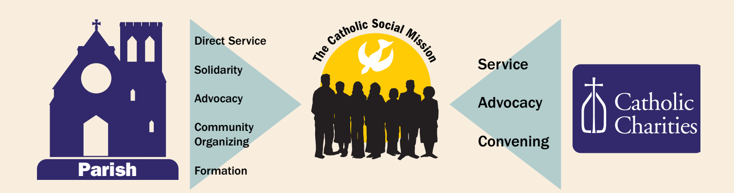
Diagram I depicts the contributions that Catholic Charities and parishes make to fulfill the Catholic social mission of caring for poor and vulnerable people and working for justice. Catholic Charities contributes through service, advocacy, and convening. The parish contributes through its social ministry.

Recognizing the value of each other's unique contribution helps to build respect between Catholic Charities and parishes and create a relationship of mutuality. It also facilitates the process of designing a partnership that will create synergy so that more people are cared for and the prophetic voice for justice is amplified.