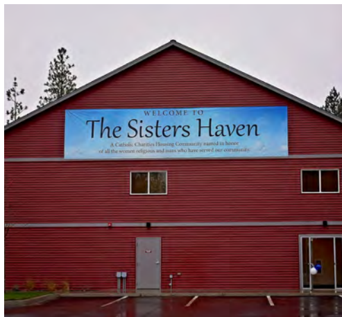
'The Sisters Haven' family permanent supportive housing at the site of the former Holy Names convent - Spokane, WA

Additional profiles will be included as members continue to preserve current projects and add units with new projects.