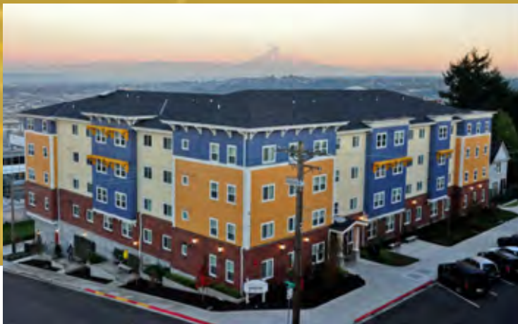
'Guadalupe Homes' for formerly homeless families on parish-owned vacant land - Tacoma, WA

CHS works with the diocese or individual parishes on affordable housing projects that utilize surplus church property. Most of our property acquisition negotiations are done with the diocese. In this case, a long-term parishioner advocated for the project. Knowing a key parishioner brings trust and access to the decision makers.