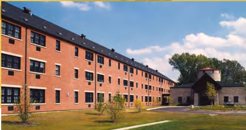
Land near St. Peter Claver church converted to 'St. Peter Claver' senior housing - Chicago, IL

All projects, demolition, new construction or rehabilitations present challenges. Renovations can be costly and difficult, particularly if parishioners want to keep the building exterior for historical or emotional reasons. Parish project partnerships on the site of fully functioning parishes can be a blessing and a challenge. Some parishes prefer long-term leases versus an outright sale although this is not viable in every case.