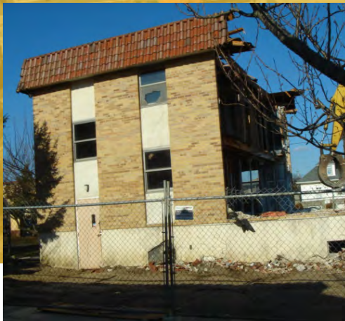
Demolition of vacant St. Peter’s convent makes way for affordable housing - Pleasantville, NJ

A ‘Parish-based’ affordable housing development strategy brings the support of the local priest, parishioners, etc. to the community and approval process. Agencies should examine parish and church-owned surplus properties to gauge project suitability and perform informal market analysis. Applications for project funding provide insight into the scoring criteria, such as proximity to transportation, services etc. Some dioceses have real estate departments that can also provide valuable information about surplus church property.