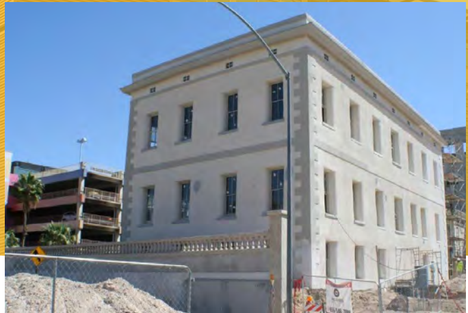
The transformation of Marist College into affordable housing - Tucson, AZ