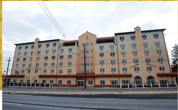
Completed ‘Village at St. Peter’s’ affordable senior housing project - Pleasantville, NJ