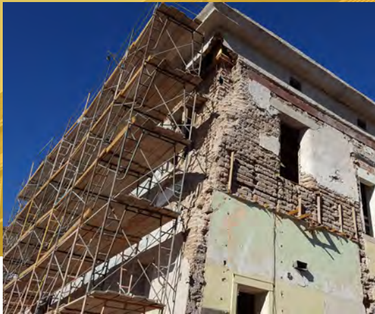
Construction and rehabilitation on Marist College - Tucson, AZ

Sometimes, surplus church property is located deep within the community and near major bus lines and, in the case of the Marist, right next to a light rail station. One of the most important factors to FSL as a developer is to locate our residents near or along mass transportation. The Marist College is a $1 per year, 75-year lease of land and building and FSL purchased the diocesan administrative building for $2.5 million.