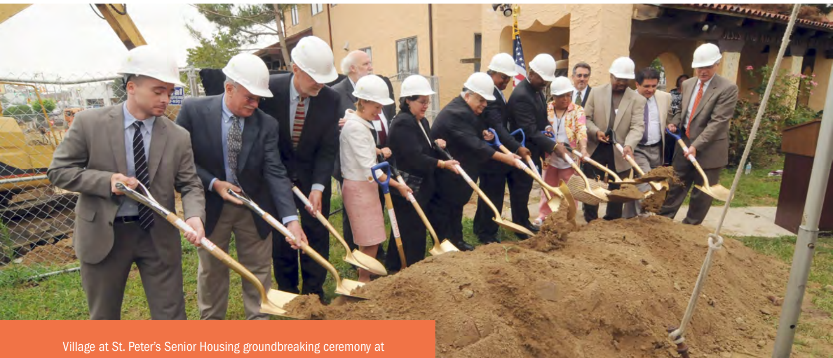
Village at St. Peter's Senior Housing groundbreaking ceremony at site of a vacant convent - Pleasantville, NJ

Finding alternative uses for surplus church property, including conversion to affordable housing, is not a new concept. There are many creative ways to convert surplus property into affordable housing properties to serve all. Much like the different locations and real estate markets where Catholic Charities agencies operate, housing projects differ (seniors, special needs, families, etc.), transactions vary (tax credits, HUD, USDA) and the final products are unique (high rise, garden style, etc.), but the results are the same: quality affordable housing for the long term.