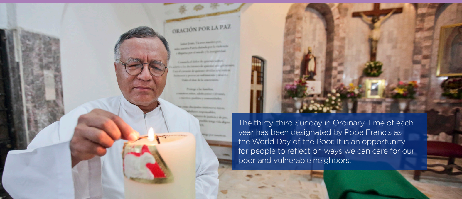
The thirty-third Sunday in Ordinary Time of each year has been designated by Pope Francis as the World Day of the Poor. It is an opportunity for people to reflect on ways we can care for our poor and vulnerable neighbors.